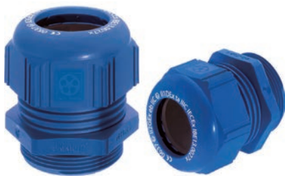
SKINTOP® K-M ATEX plus blue