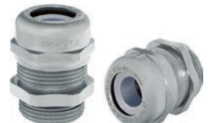
SKINTOP® MSR-M ATEX