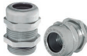
SKINTOP® MS-M ATEX