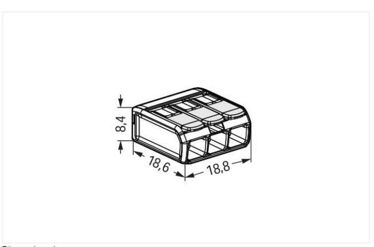
Dimensions in mm