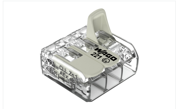
\hbox{Color:} \ \square \ \hbox{transparent}