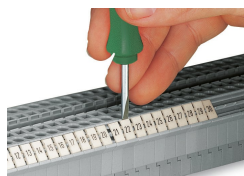
Snapping a marking strip into the marker slot.