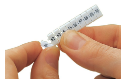
Separating an individual marker from the WMB marker strip – for larger terminal blocks.