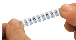
Stretching a WMB marker strip.