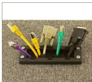
... as well as for energy and building technology