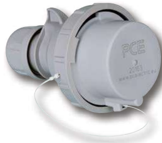
0152-6TT + 20165